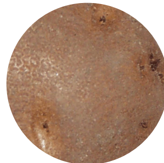
Norkotah treated with Sprout Torch®